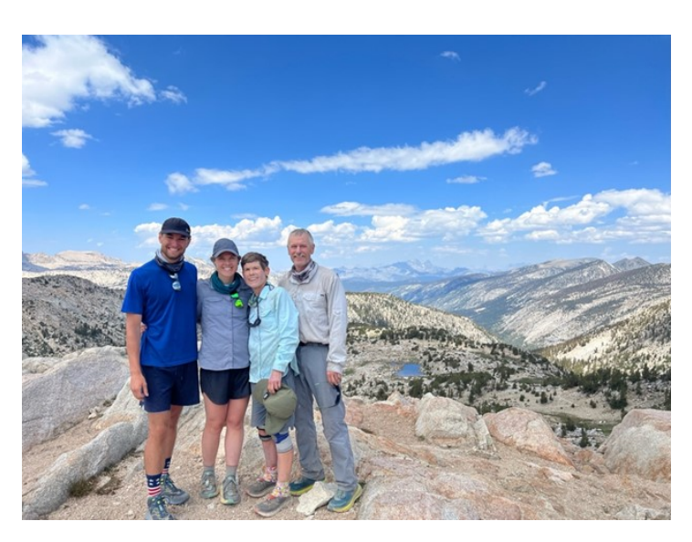
The group at the top of Silver Pass

national forests and the most beautiful vistas in the continental United States. Everyone always asks how you do something like this, and it's pretty simple. You walk one step at a time. Some steps are harder than others and you do a lot of steps, but you just keep going. We walked an average of 12-14 miles a day and climbed up to altitudes of 13,000 feet! Each morning we would break down our campsite and each evening we would set it up again. All our food was carried in bear proof